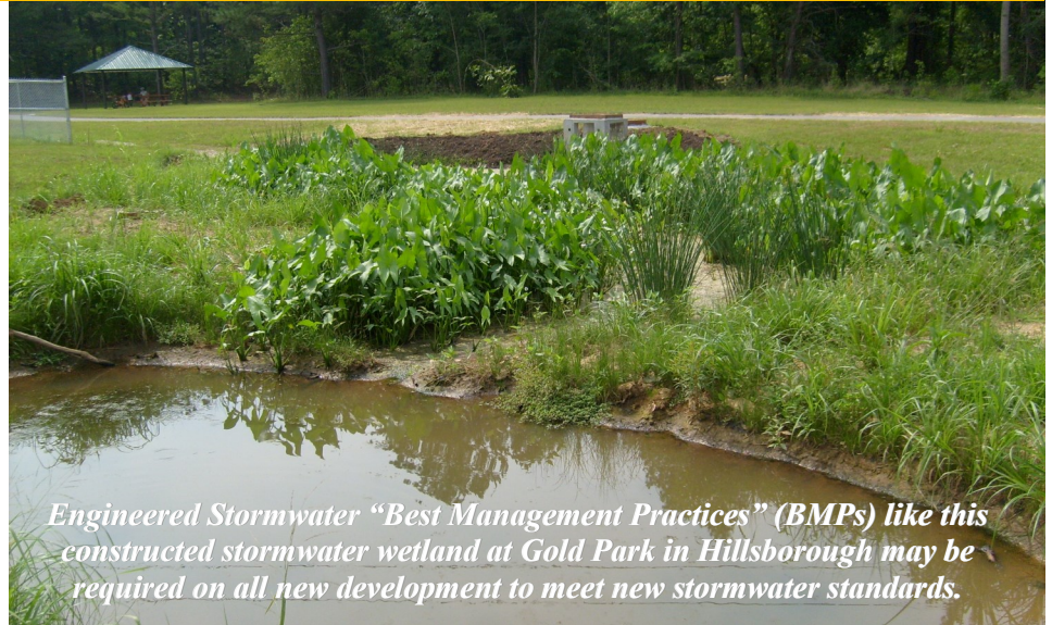
Engineered Stormwater “Best Management Practices” (BMPs) like this constructed stormwater wetland at Gold Park in Hillsborough may be required on all new development to meet new stormwater standards.

Through a long stakeholder process, nutrient reduction strategies were developed for both lakes as well as all lands/waters draining to them. To address nutrients from stormwater runoff, reductions will be required from both existing developed areas as well as new development.